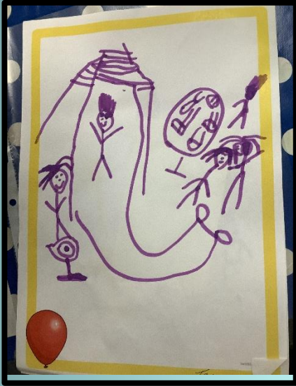
Going to the park after school

BT1:A3 AT1:A4 Children will be able to talk about how they feel when they have good news to share and when they hear good news.