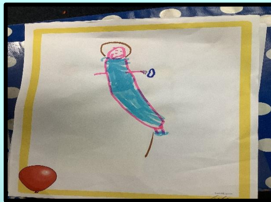
Putting a cube in the jar