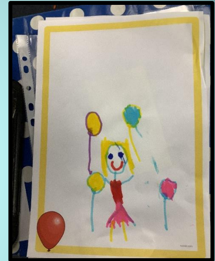
I am going to a party.