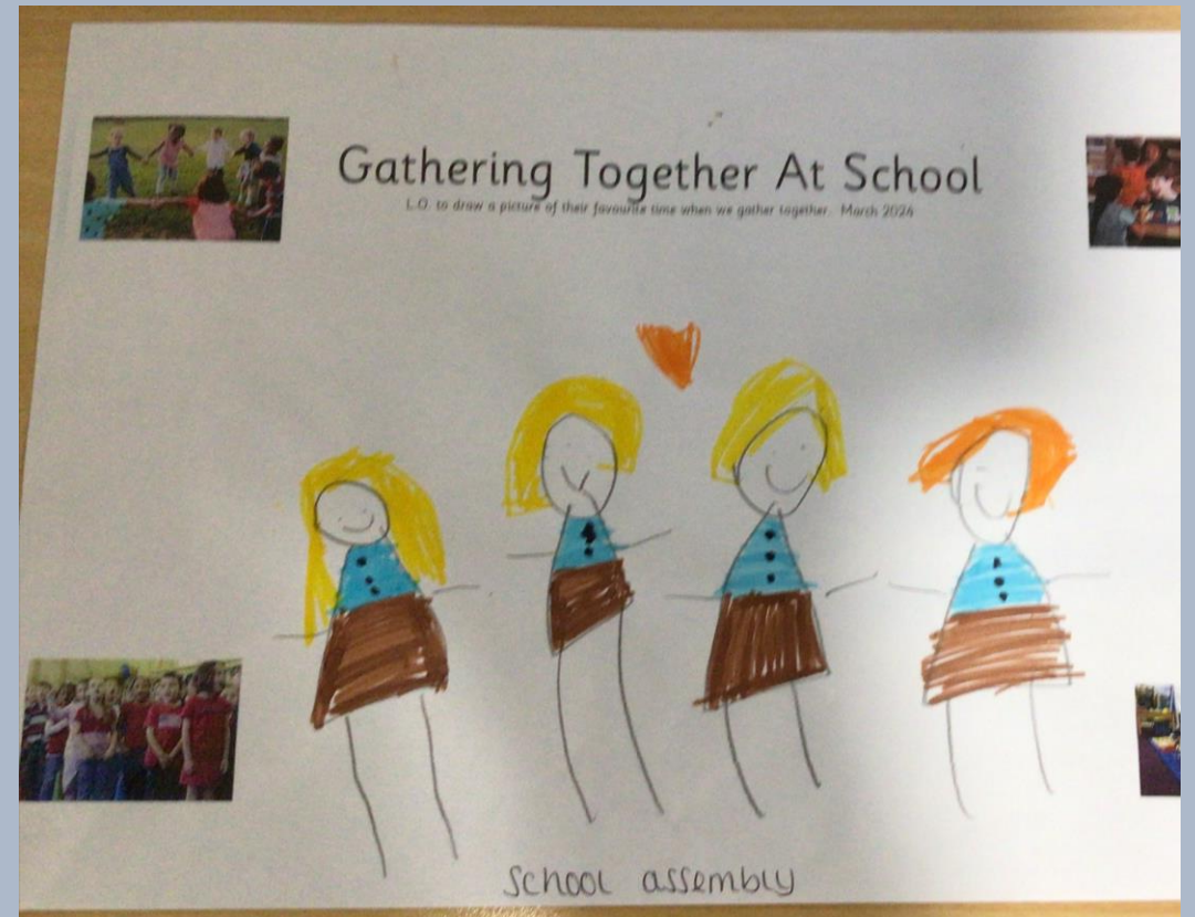
Going to Assembly together